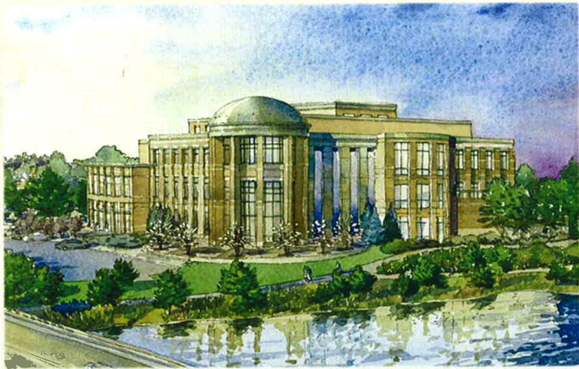
Color rendering of the new Great Falls Courthouse.

Following a competitive bidding process by GSA for the construction of a new build-lease courthouse in the Great Falls division, a selection panel comprised of Court and GSA personnel selected an offer by BC Development, Inc., in May of 2007 to construct a 42,000 sq. ft. Courthouse on the banks of the Missouri River. The need for the Courthouse was recognized as part of the Court's 1992 and 2004 Long Range Planning forecasts, and approval was received from the Ninth Circuit Judicial Council and the Executive Committee of the Judicial Conference of the United States during 2006.