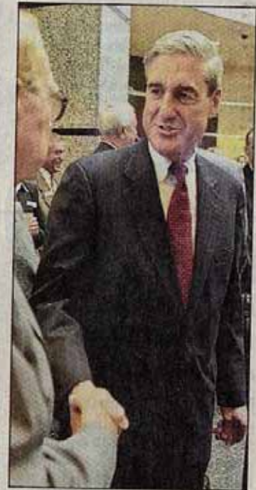
FBI Director Robert Mueller was in Birmingham for Thursday's official opening ceremony.

The gated, three-story building has a two-story atrium and houses almost 200 employees, who began the moving process